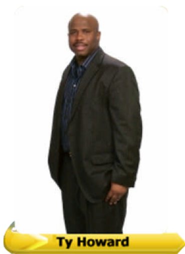
Dynamic Youth Speaker™

Want to see Ty in action (speaking / presenting)? Visit http://www.dynamicspeakers.com/watch_ty.htm